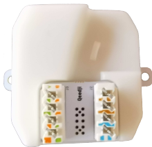
KRONE to USB-C adapter