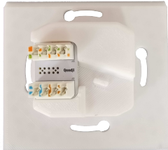
KRONE adapter to TAB10s